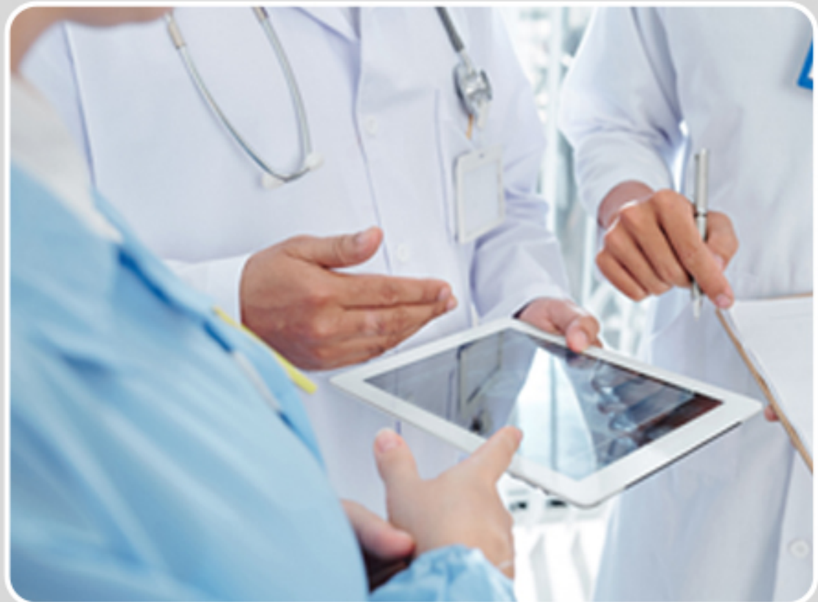
Enhanced Clinical Collaboration