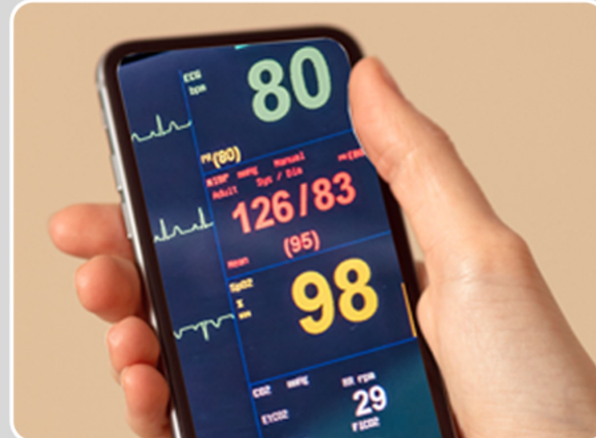
Smart Alarm Management