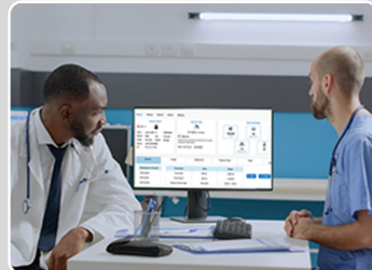
Remote View and Management