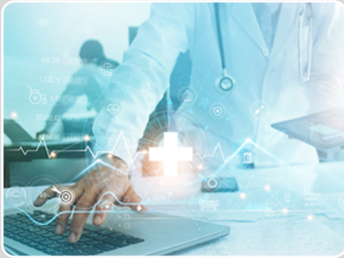
Unified Patient Dashboard